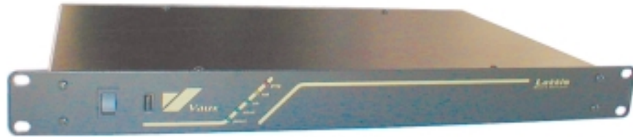
Lattis switcher LE-800A

The Lattis Family of Matrix Switchers provides simple solutions for routing stereo-audio and composite-video signals - with full volume-control on all zones. A complete RS-232 protocol, as well as infrared control capability, allow a flexible, and expandable, multi-zone A/V system.